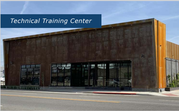
Technical Training Center