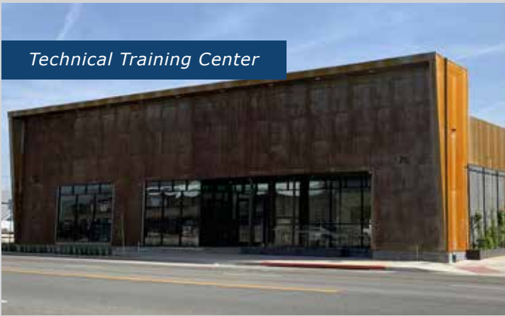
Technical Training Center